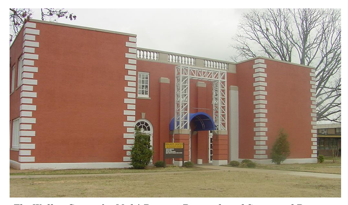
The Walker Center for Multi-Purpose Research and Sponsored Programs